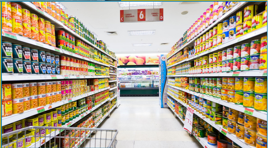
Retail Shelving Systems