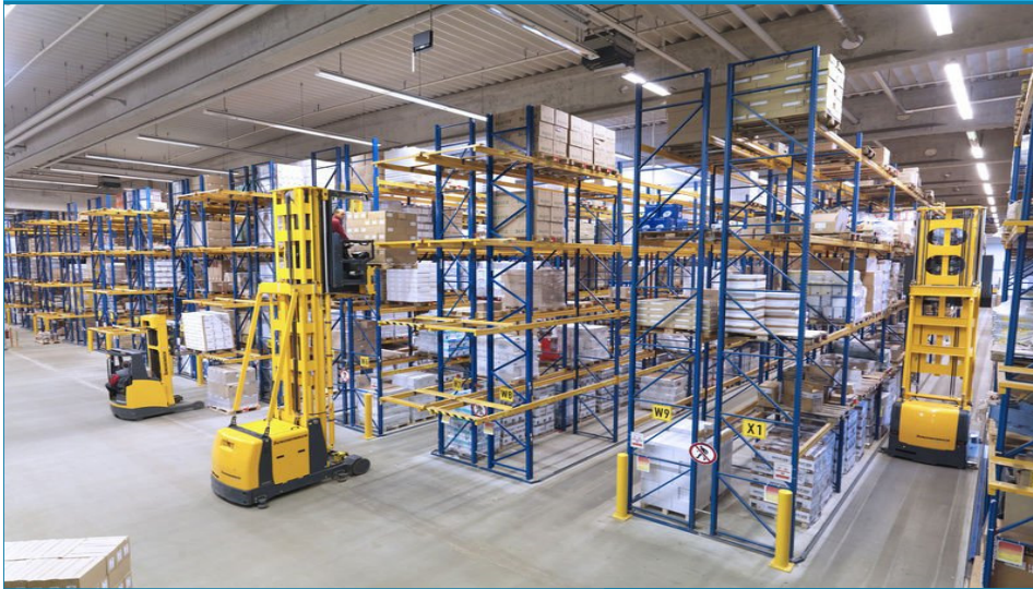
Industrial Racking Systems